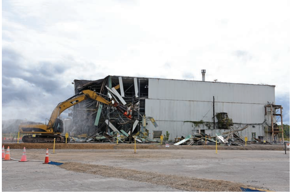
K-1232 Chemical Recovery Facility during and after demolition

The 140-ft by 60-ft, two-story facility was built in the early 1970s to recover chemicals resulting from site operations. Recovery operations were shut down in 1982, and the facility was then used to treat wastewater from the Y-12 National Security Complex during the 1980s and early 1990s.