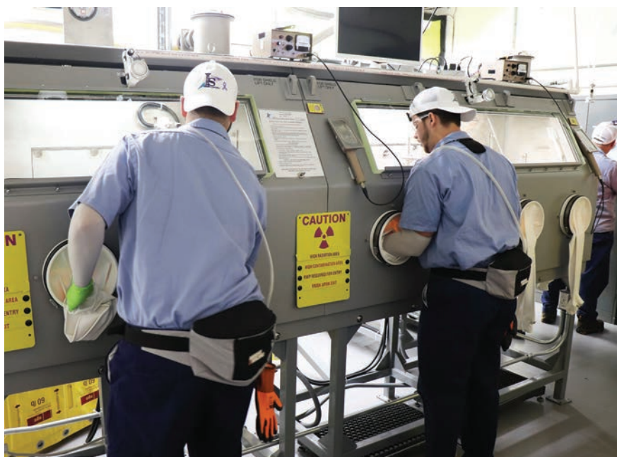
Fissionable material handlers working in a glove box in Building 2026

Processing operations were originally scheduled to begin in October 2020 when crews are set to finish upgrading hot cells in an ORNL facility. The upgraded cells will be designed to handle larger amounts of U-233, providing more shielding for workers equipped with mechanical arm manipulators.