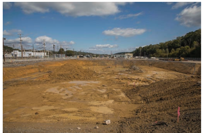
Excavation underway at the treatment facility area

treatment facility, installation of secant pile walls near East Fork Poplar Creek, and relocation and demolition of existing infrastructure and structures to prepare the site for construction of the mercury treatment facility.