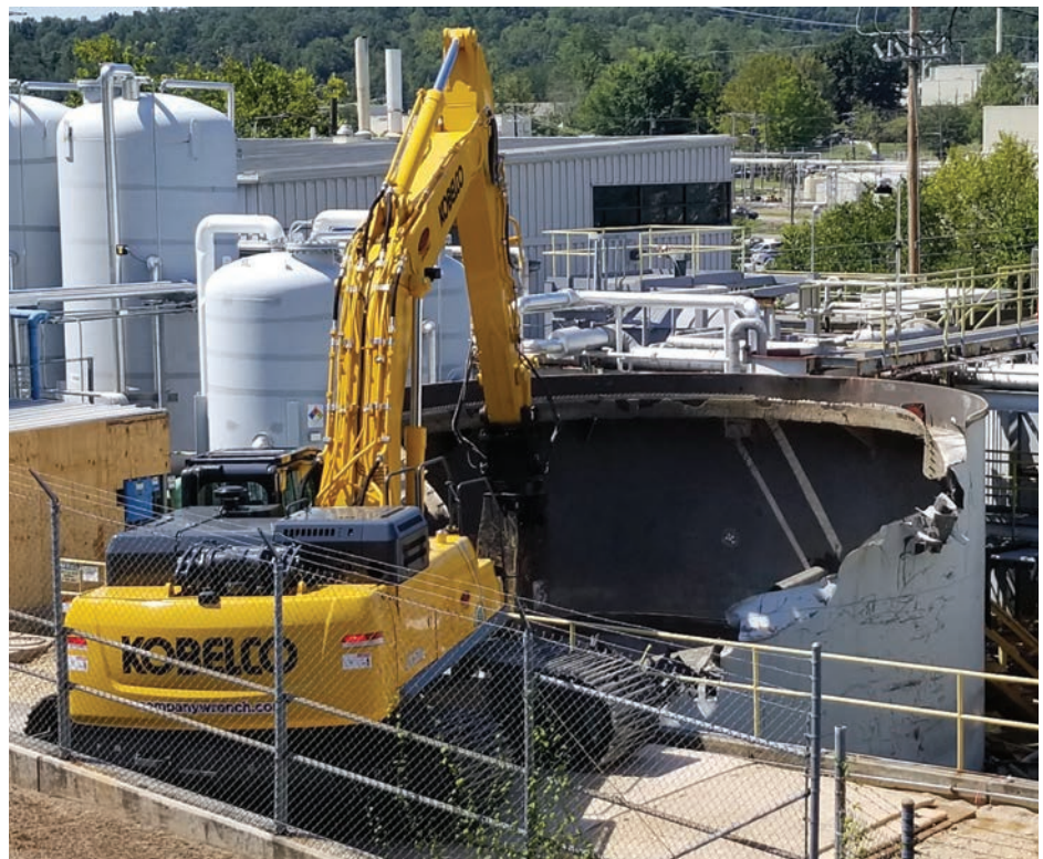
Workers are demolishing equipment at 3608 to make room for new equipment

At the Liquid and Gaseous Waste Operations (LGWO), which processes wastes from ORNL and other sources, the Zeolite treatment process is planned to be moved out of Building 3544 (the radiological wastewater treatment facility), which has exceeded its design life and is scheduled for demolition. The new treatment system will be housed at Building 3608 (formerly, the non-radiological wastewater treatment facility). Workers are demolishing existing equipment at 3608 to make room for the new equipment. These infrastructure upgrade projects are vital for a system that helps one of the nation's most important research sites, ORNL, remain operational.