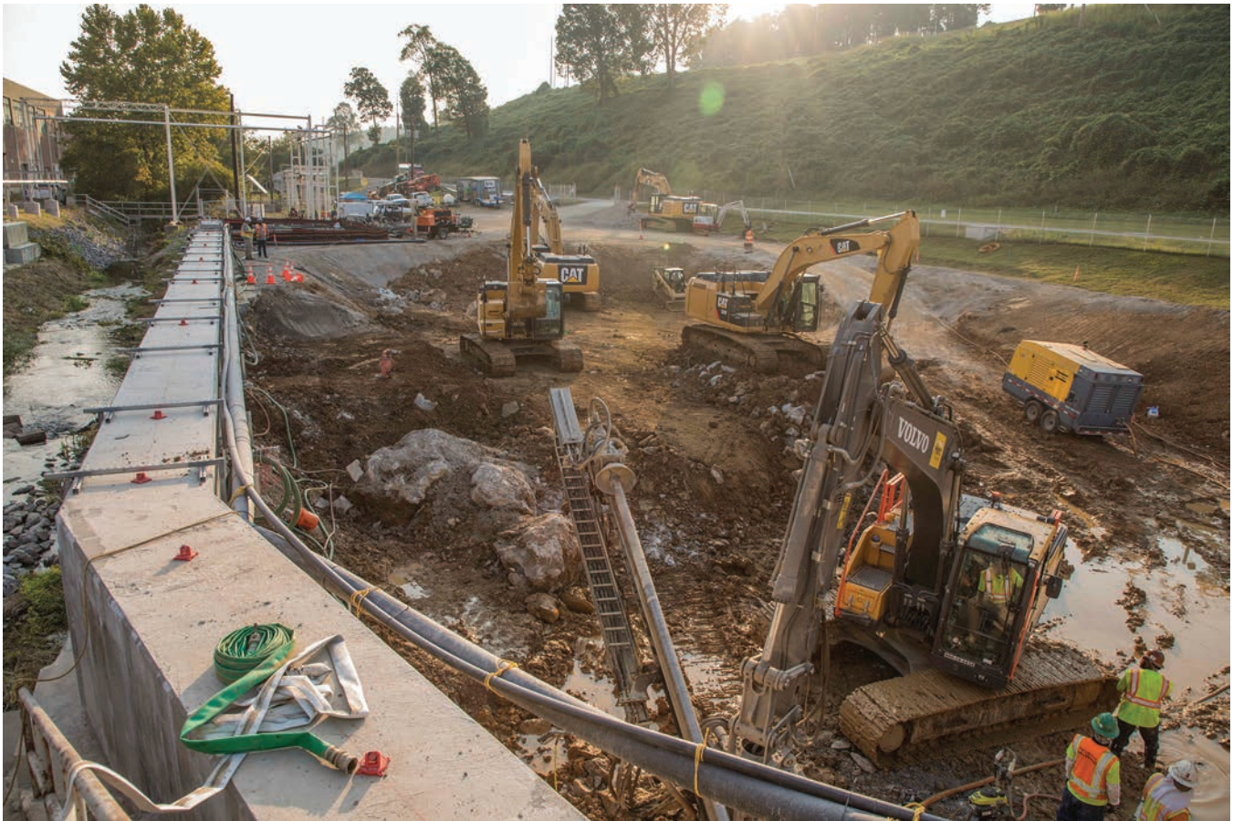
Excavation underway at the headworks facility area