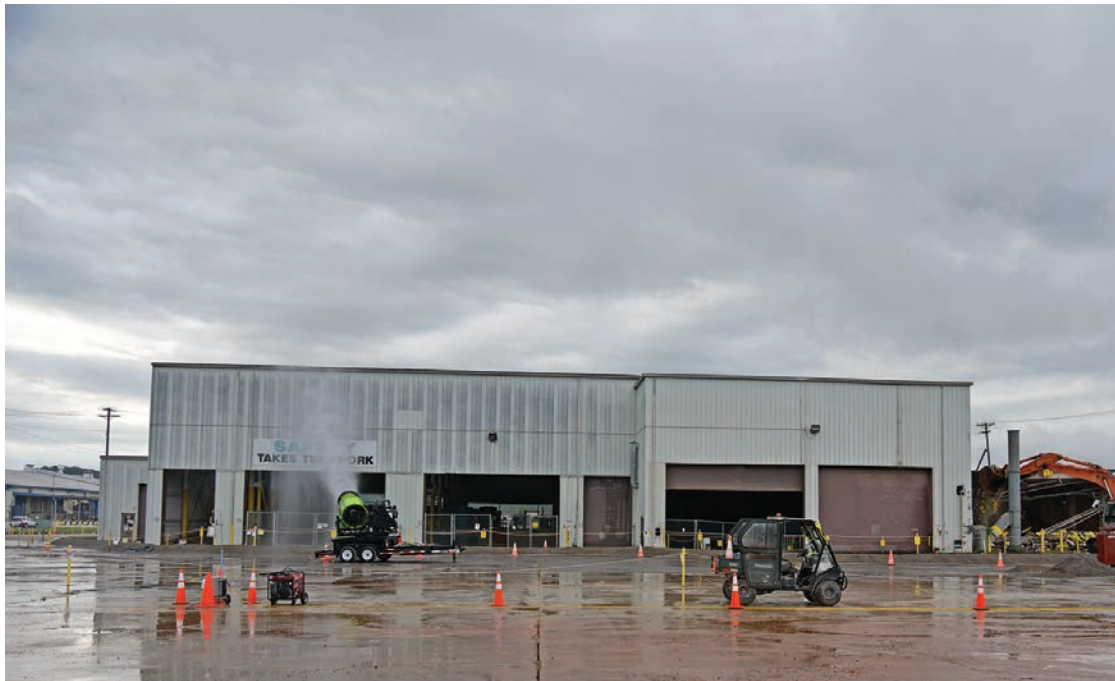
K-1423 Building as demolition begins and after it is completed

It operated for that purpose from 1969 until 1986. The building was later used for a variety of purposes, including addressing radiologically contaminated drums, washing chemically contaminated drums, and storing waste.