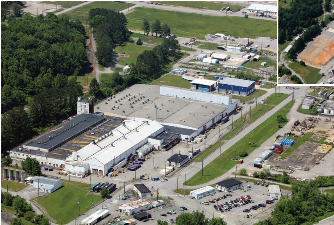
K-1037 before and after demolition