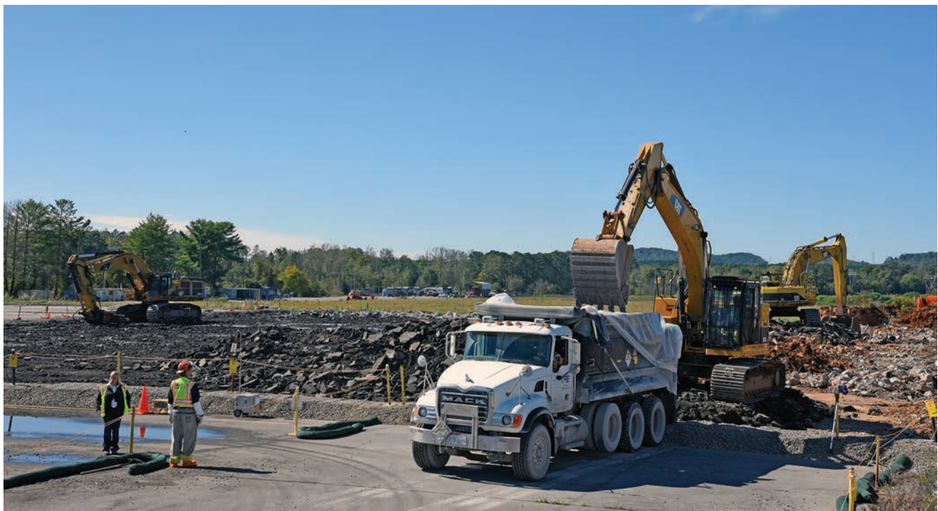
The slab removal at the K-29 site opens up more land for industrial development

Completion of this project, combined with the adjacent Poplar Creek area, furthers the mission of making property area available for economic development.