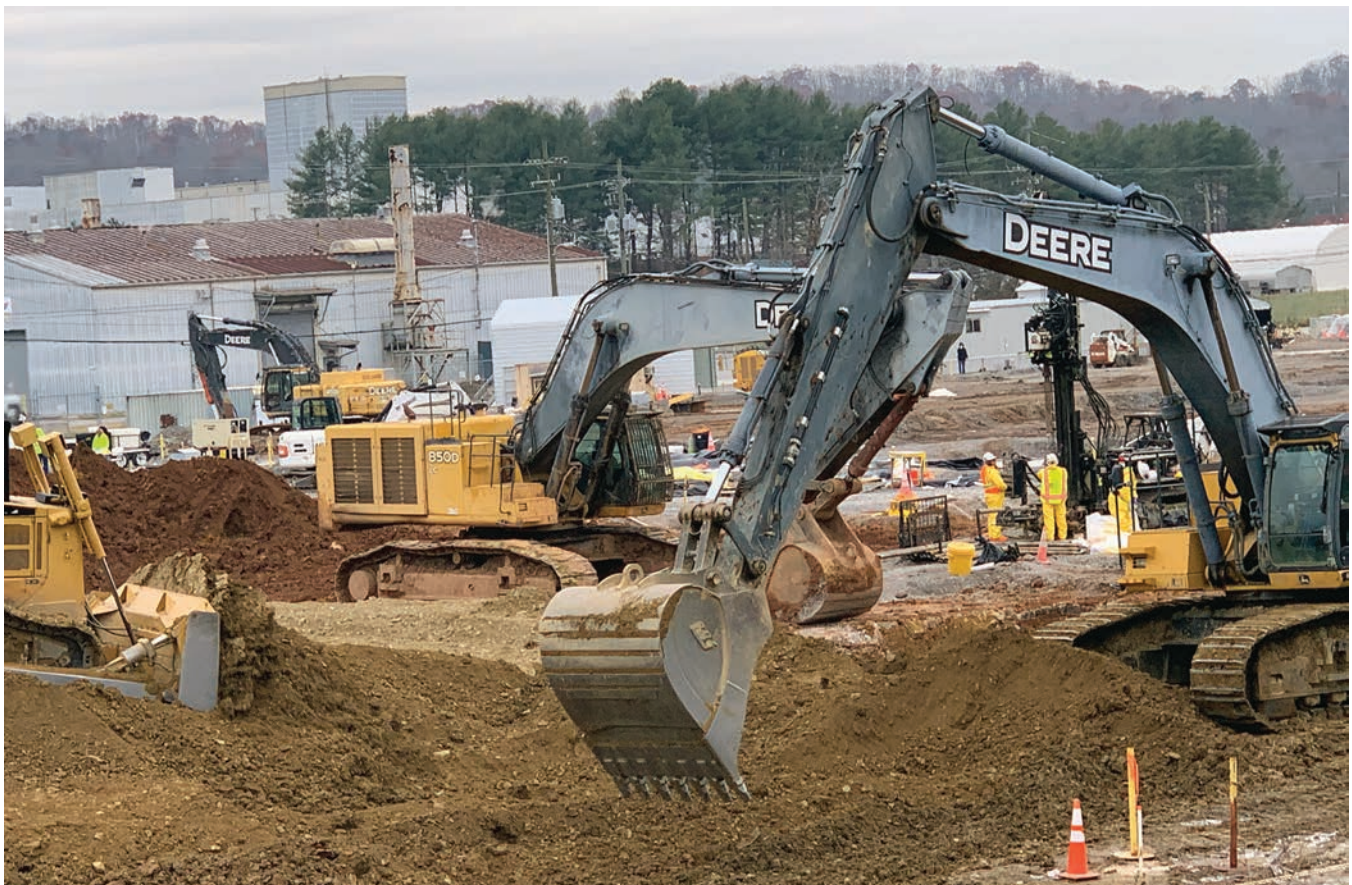
Excavation of Tc-99 contaminated soil

In FY 2019, OREM and UCOR completed characterization and remediation of EUs Z2-11, -14, -15, and -37. The slabs for Buildings K-27 and K-29 were removed in EU Z2-14. As part of a major remediation action, crews continued to excavate and remove soil contaminated with concentrations of technetium-99 (Tc-99) to meet regulatory standards.