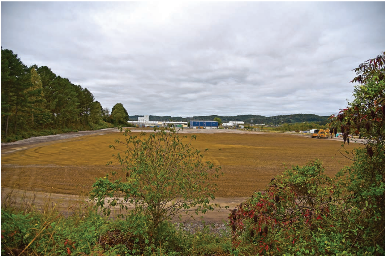
K-1037 site after demolition and slab removal