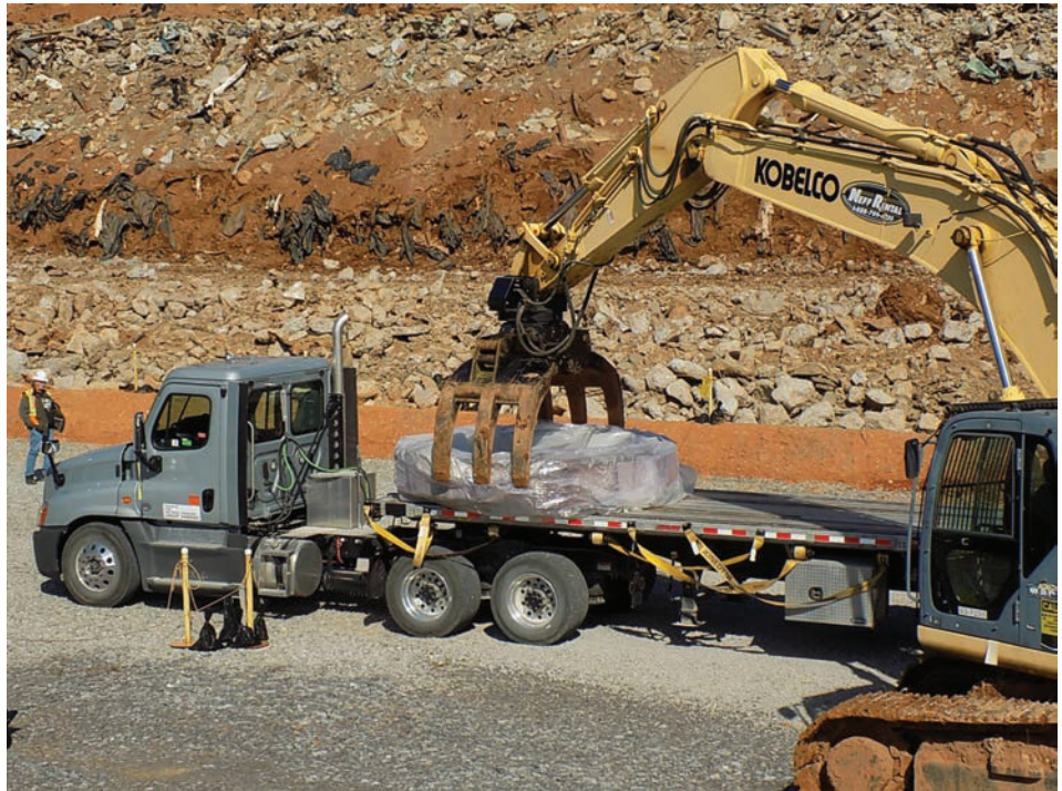
Receipt of oversized item at EMWMF

DOE also operates and maintains solid waste disposal facilities, the Oak Ridge Reservation Landfills. In FY 2019, these three active landfills received 11,100