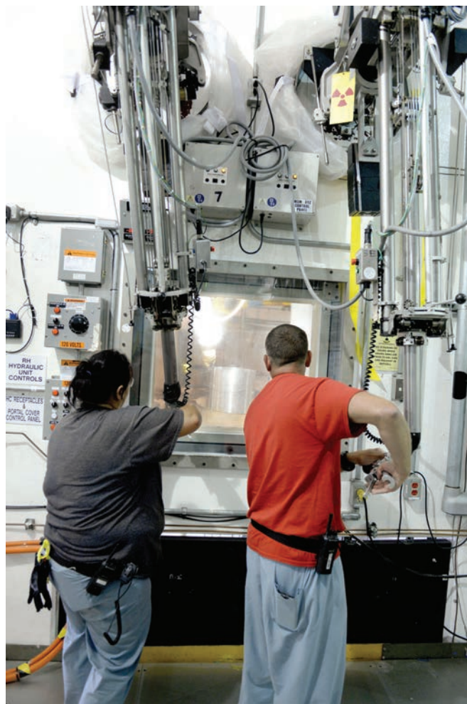
TWPC operators using manipulators to process highly radioactive transuranic waste inside the hot cell

OREM will conduct initial testing through the design and construction of a mock test facility and offsite testing at vendor facilities. Once the technologies are matured, the design of the final processing facilities and systems can be completed and construction can begin. In FY 2019, workers continued to make progress on the Sludge Mobilization System, Slurry Mixing and Characterization Tank, and Mobilization Measurement Instrumentation, as well as design documents for the Sludge Test Area to support technology maturation and compliance with a Site Treatment Plan milestone.