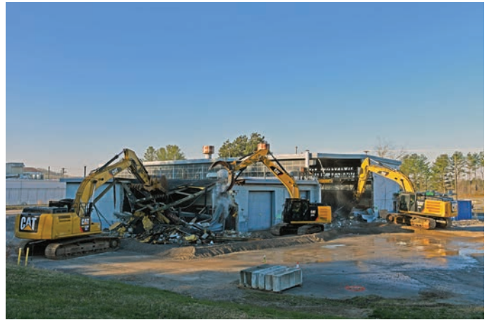
K-1414 Garage demolition

The structure was built in 1949 and operated until early 2018—long after the site's uranium enrichment operations ceased in the mid-1980s. The building covered more than 12,000 square feet and served as the maintenance hub and fueling station for vehicles used to support the site's enrichment and, later, cleanup missions.