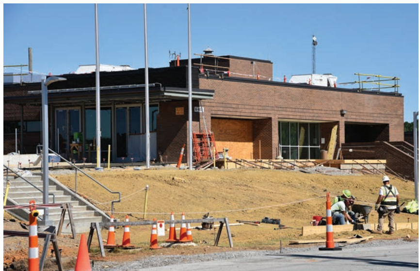
Workers are preparing walkways for the History Center

After an extensive renovation project, the K-25 History Center is nearly complete for the community. This commemorative facility was commissioned through a Memorandum of Agreement to enable OREM to complete decontamination, decommissioning, and demolition of historic structures at ETTP. As construction nears completion, exhibits are arriving on site and being moved into the building. The K-25 History Center will feature exhibits, artifacts, and audio-visual displays to interpret the significant role of the K-25 site in the Manhattan Project and Cold War, and to commemorate the people who worked there.