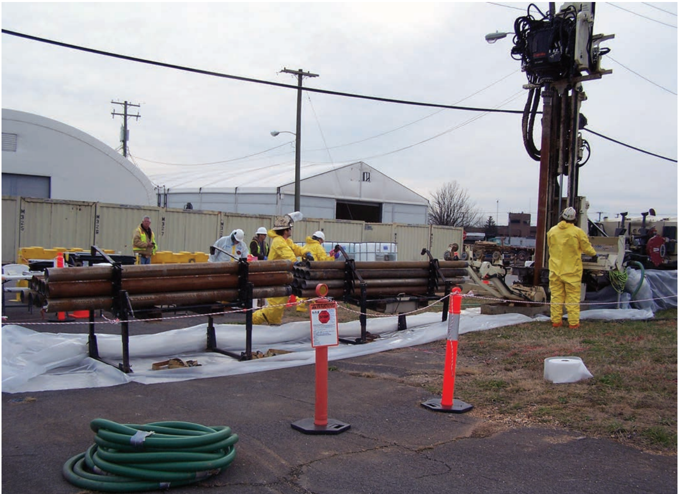
The Oak Ridge Reservation has an extensive network of monitoring wells that provide valuable groundwater data