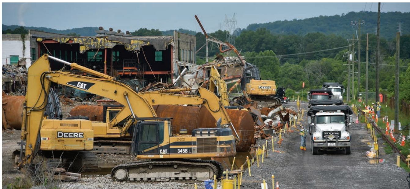
Transportation personnel haul debris from K-131/K-631 demolition for disposal. Each truck is inspected and the load covered to ensure safe transport.

With demolition completed, the Poplar Creek area and the adjacent footprint of the previously demolished K-29 gaseous diffusion building will begin undergoing a regulatory approval process. That will continue ETTP's transformation and enable its next chapter as a privately-owned, multi-use industrial park.