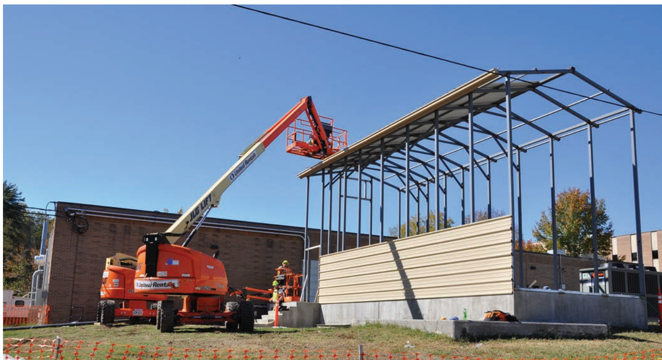
Workers construct housing for large tanks at the ORNL Aquatic Ecology Lab

Studies have been conducted to evaluate alternative treatment chemicals on mercury flux, the effect of sorbents on mercury and methylmercury concentrations in the presence of dissolved organic matter, and the use of mussels as a tool for reducing particle-associated mercury in the water column. ORNL scientists have prepared a report titled "Mercury Remediation Technology Development for Lower East Fork Poplar Creek—FY 2019 Update." This report provides a detailed description of each of the study areas and findings from studies performed in FY 2019.