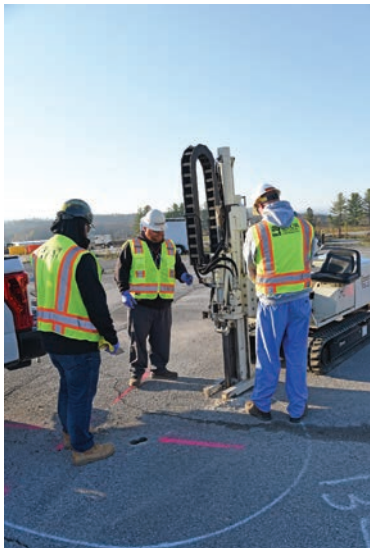
Workers sample the K-1232 slab after demolition