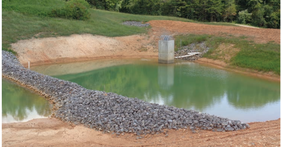
Erosion controls put in place at the Oak Ridge Reservation Landfills

waste shipments, totaling 123,376 cubic yards of waste.