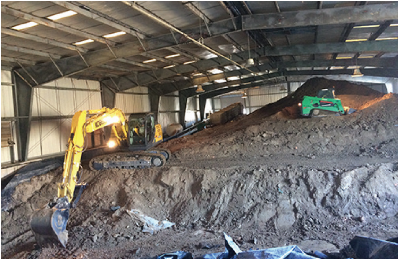
Workers dispose soil resulting from the closure of oil retention ponds

The removal of soil paves the way for OREM to reuse the building where the soil was stored. Workers conducted sampling to confirm the facility is safe for future projects. OREM expects to use the facility for research on waste treatment and cleanup at the Y-12 National Security Complex.