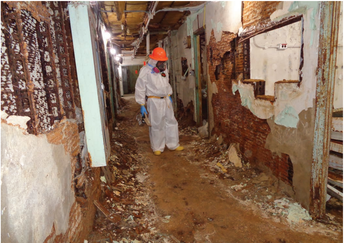
Workers perform characterization and asbestos abatement inside the Biology Complex to prepare the structures for demolition in 2020