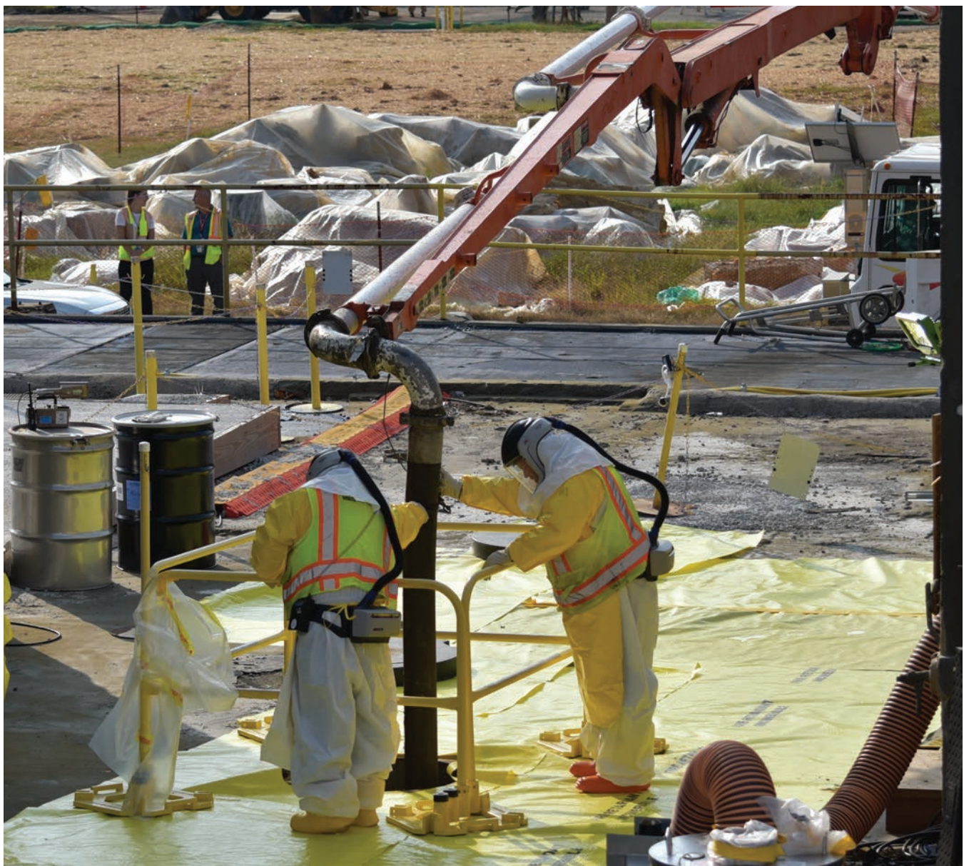
Workers grout the transfer tunnel at the 3026-D hot cell

Deactivating these facilities paves the way for future demolition, which will remove a significant risk from the heart of ORNL and open land for future research and science missions.